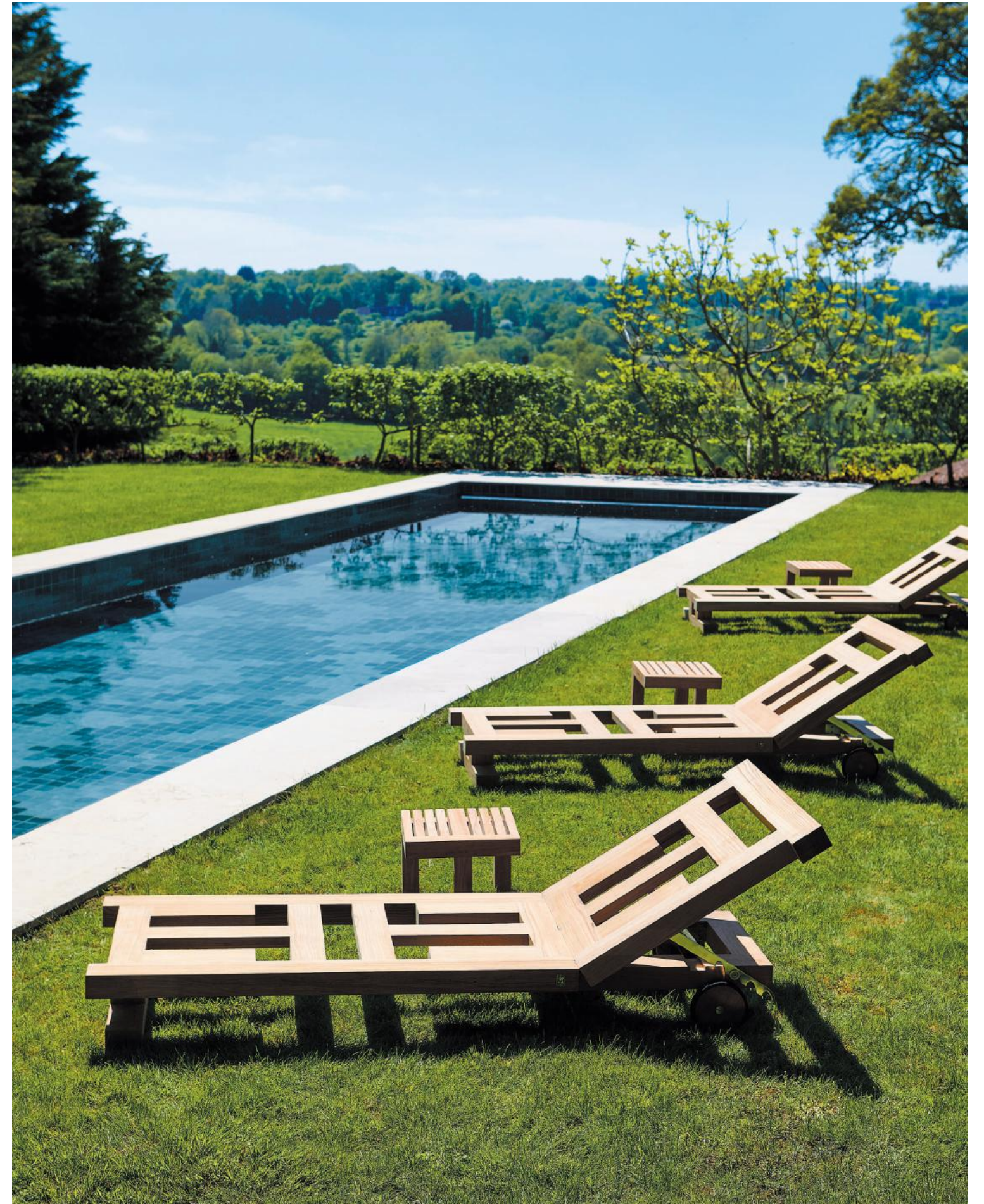
SUNLOUNGER NAR 195 - LOW SIDE TABLE 40T