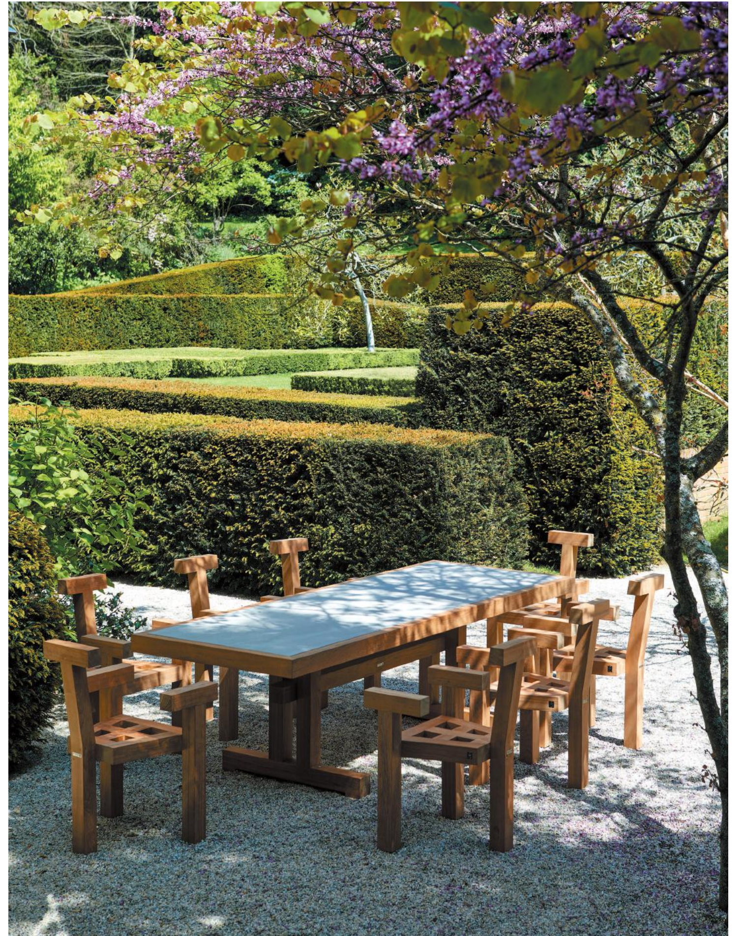
RECTANGULAR TABLE NAR 250- CHAIR NAR 53