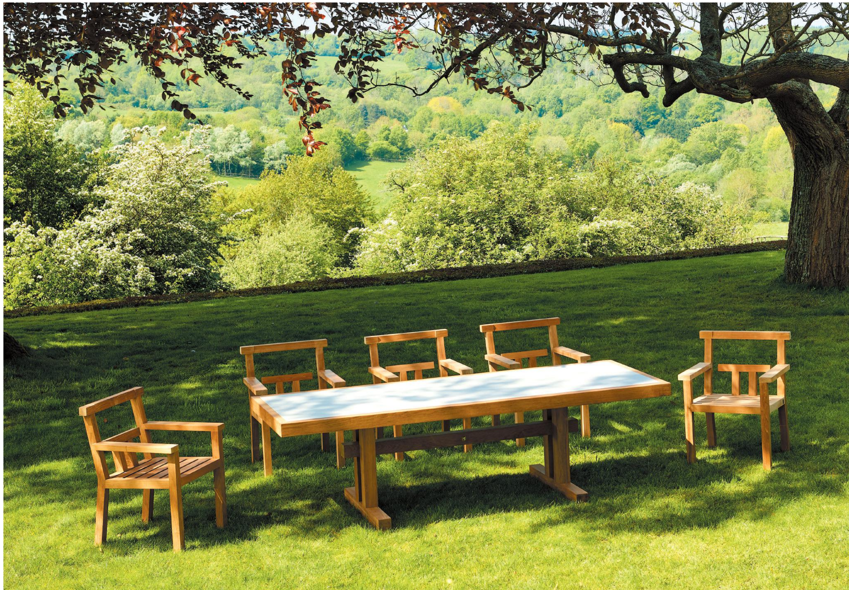
RECTANGULAR TABLE NAR 250- CHAIR NAR 55