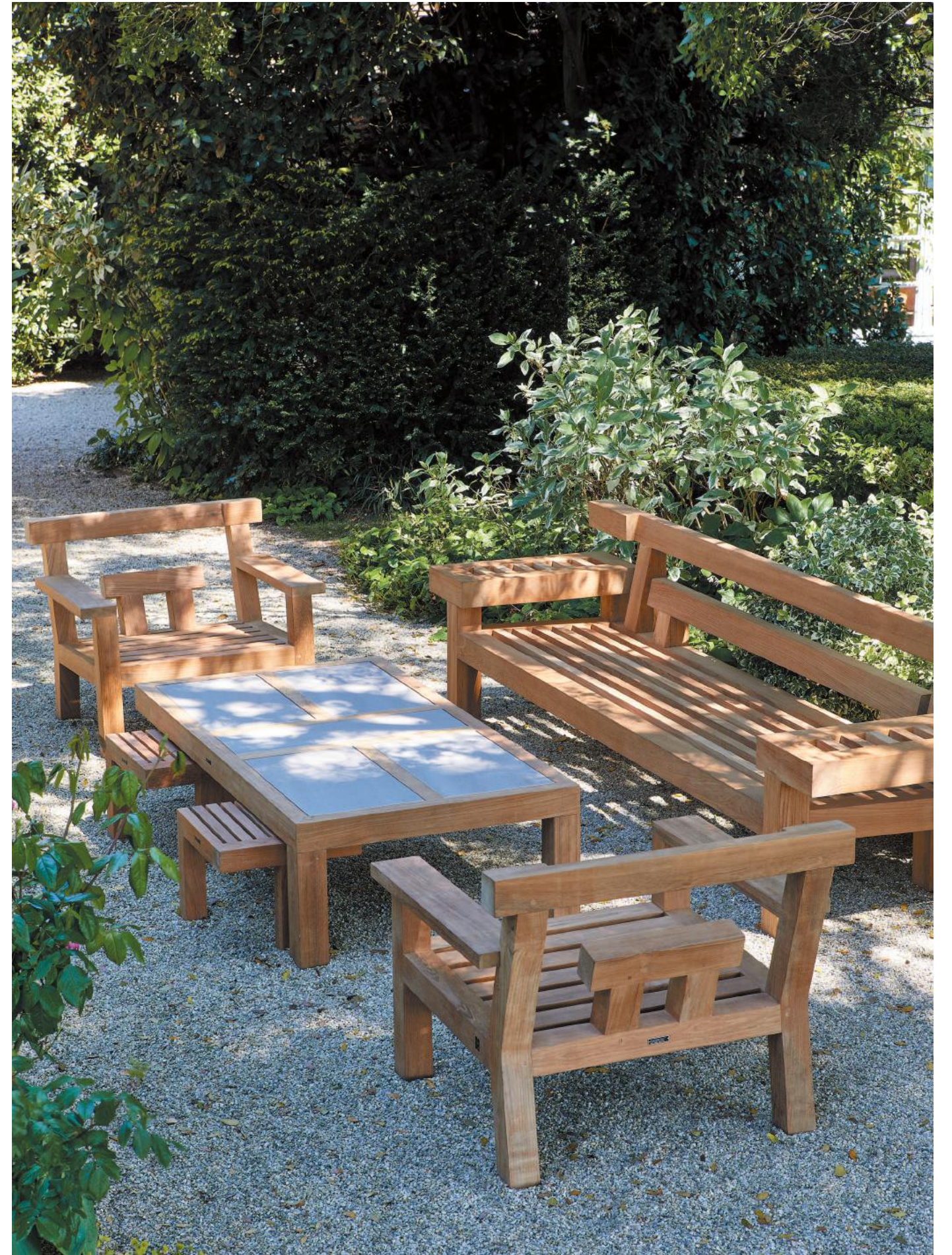
LOUNGE ARMCHAIR NAR 77- LOUNGE BENCH NAR 265- LOW TABLE NAR150T- LOW SIDE TABLE NAR 40T