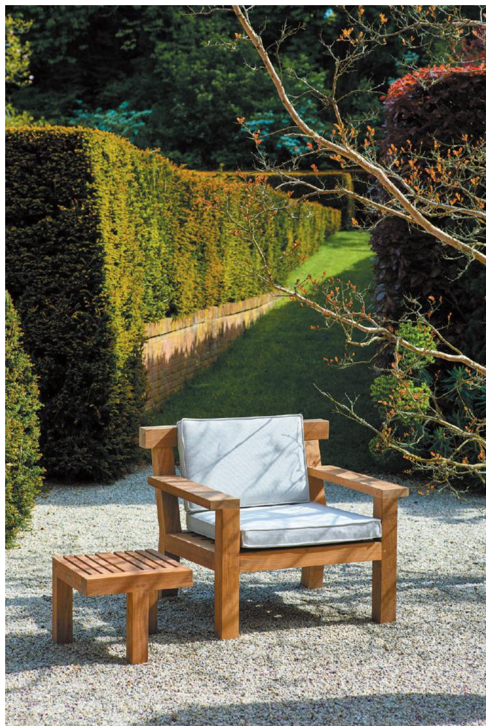
LOUNGE ARMCHAIR NAR 77- LOW SIDE TABLE NAR 60T