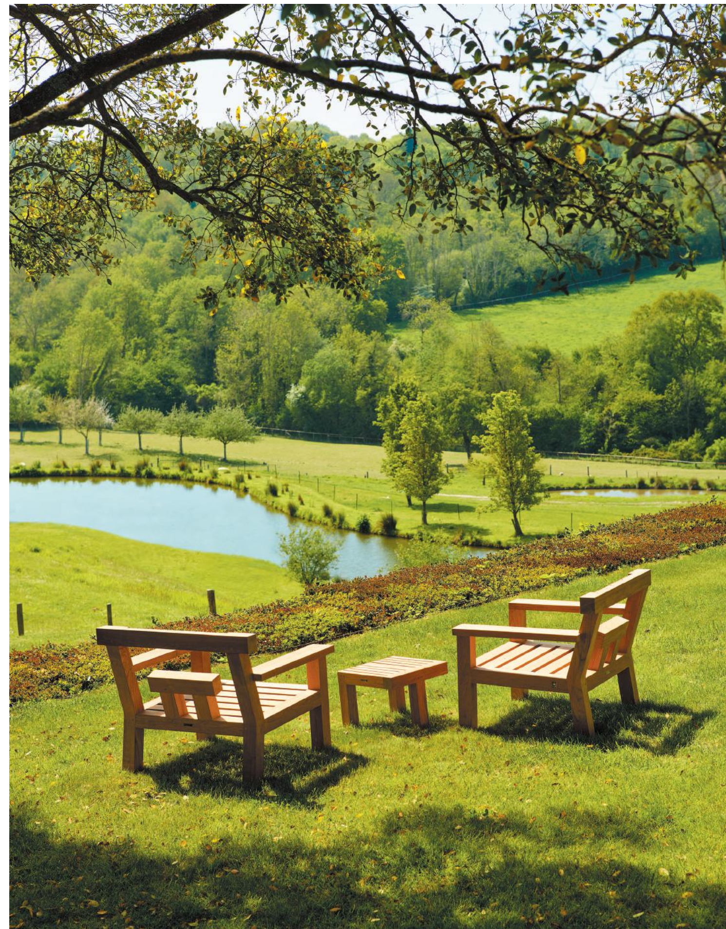
LOUNGE ARMCHAIR NAR 77- LOW SIDE TABLE NAR40T