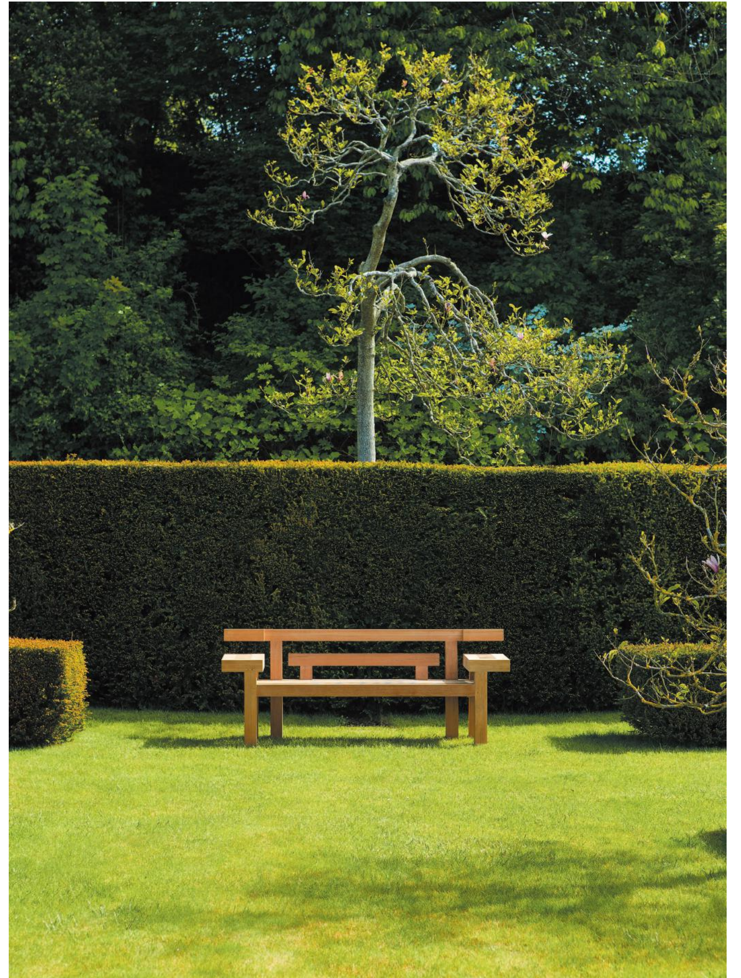
GARDEN BENCH NAR 210